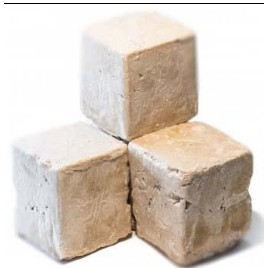
Fig 3: Kokum butter