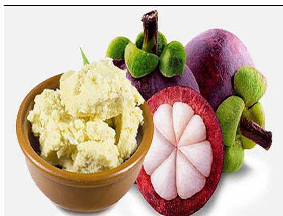
Fig 2: Kokum butter

Kokum butter is derived from the seeds of the kokum fruit, which possess an edible oil content ranging from 23% to 26%. The extraction process involves crushing the seeds and subjecting them to boiling with water, followed by the removal of the top layer of fat. Kokum fat may also be isolated by the process of solvent extraction. It is worth noting that kokum butter consists of around 30% crude fat. Initially, crude kokum butter has a yellow hue, but after the refining process, it undergoes a transformation and becomes white in color [5].