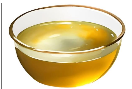
Fig 5: Cod liver oil