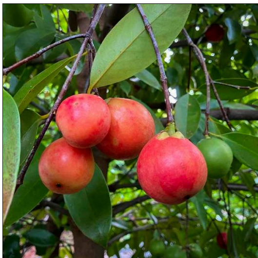
Fig 1: Kokum fruit

2.5- 3 cm in width. The flowers of the kokum plant are pink and succulent. The fruit is generally brownish or brownish grey in color with a yellow marbled pattern. It is surmounted by a stalk less stigma. Typically, six to eight seeds are found in each pod, and the substance of the kokum has a distinct flavor and aroma. A kokum fruit is roughly the size of an orange. A week is the shelf life of ripe produce. The fruit's seed accounts for a quarter of the fruit's total weight and contains approximately 40-42 percent oil [2-4].