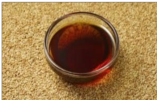
Fig 4: Sesame oil